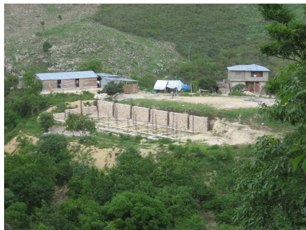
Foundation of La Pleiade School in Cange, Haiti

Tickets are now available in the front office. For the fifth year Bob & Cathy Fisher will generously open their garden for tours. Once again 100% of the 2010 proceeds will continue to support our school building in Haiti. Tickets are one sale at the church for $30.00. You can order tickets over the phone 828-526-2968 (we take MasterCard or Visa) or you can come by the church on the corner of 5th and Main Street. The dates are July 17 and 24 th . You can select tours times of 10:00, 11:00, 12:00, 1:00, 2:00 or 3:00 and purchase tickets from the church office.