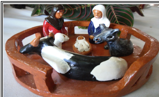
Christmas from Haiti

“All Things Come of Thee” Thank you for your response!